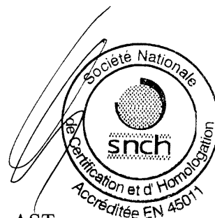
Gilles AST Expert technique