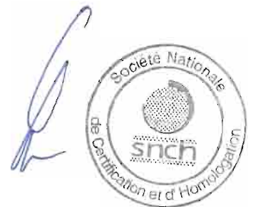
Gilles AST expert technique