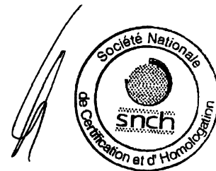
Gilles AST expert technique

We confirm that the installation of replacement silencer type 6406 on above listed vehicle(s) does not affect the performance of the original equipment catalytic converter which remains unchanged and still meets 97/24/EC Chapter 5 Directive requirements as per its last approval amendment (2005/30/EC Directive).